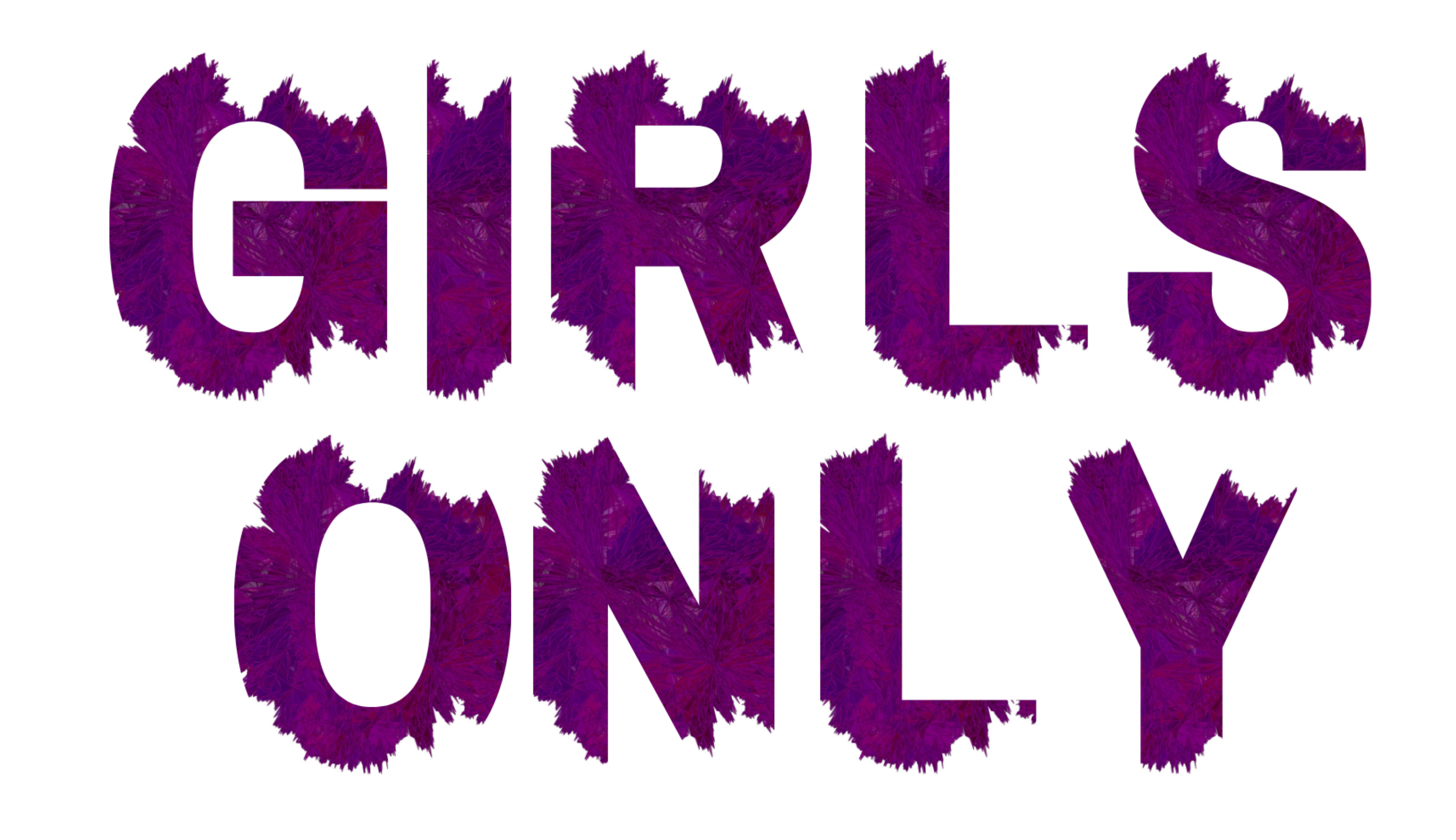
Annual Meeting of Women in Computer Science at IRIF