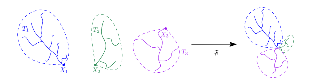
Figure 1: The operator \mathfrak{F}